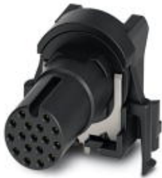
Sensor/actuator flush-type socket, 17-pos. with shroud, A-coded, with angled solder connection, contact insert only

Please be informed that the data shown in this PDF Document is generated from our Online Catalog. Please find the complete data in the user's documentation. Our General Terms of Use for Downloads are valid ( http://phoenixcontact.com/download )