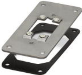
The illustration shows the product version VC-B 10-ADP/2 DSUB 15-M

Mounting adapter plates 1.5 mm thick, with UNC countersunk screws, number of inserts: 2x DSUB 15