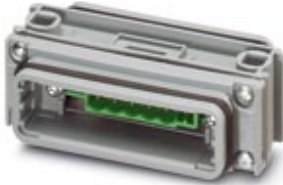
D-SUB coupling, for DeviceNet, shell size 3, header, unshielded, connection direction straight, IP67 degree of protection

Please be informed that the data shown in this PDF Document is generated from our Online Catalog. Please find the complete data in the user's documentation. Our General Terms of Use for Downloads are valid ( http://download.phoenixcontact.com )