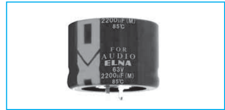
Marking color : Gold print on a black sleeve