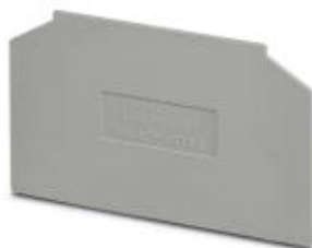
Partition plate, Length: 69 mm, Width: 1.5 mm, Height: 57 mm, Color: gray

Please be informed that the data shown in this PDF Document is generated from our Online Catalog. Please find the complete data in the user's documentation. Our General Terms of Use for Downloads are valid ( http://download.phoenixcontact.com )