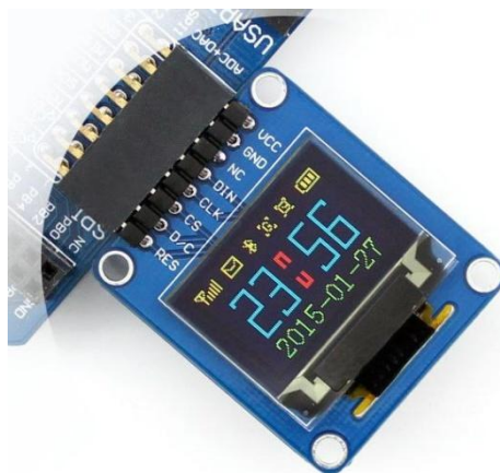
Figure 1: OLED information display

Connect module to the SPI2 interface of Open103R development board, power up. OLED displays information shows as below.