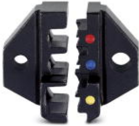
Spare die for CRIMPFOX-RCI 6-1

Please be informed that the data shown in this PDF Document is generated from our Online Catalog. Please find the complete data in the user's documentation. Our General Terms of Use for Downloads are valid ( http://download.phoenixcontact.com )